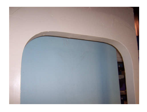
Mud & finish as normal

Fulcrum Composites, Inc. 1407 E. Grove St. Midland, MI 48640