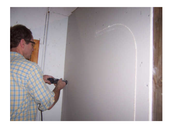
Install face-sheet, roto-zip opening. Screw into blocking