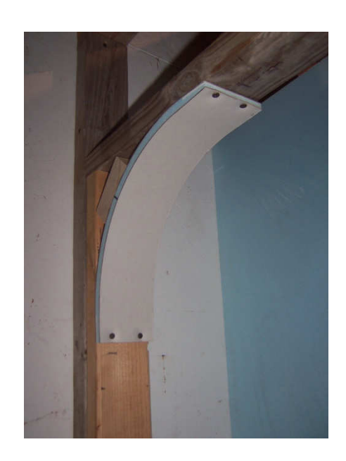
Fasten corners in place with drywall screws