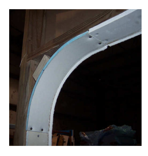
Add flat drywall strips around jamb