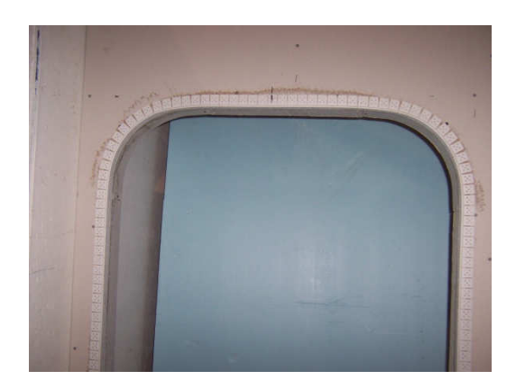
Trim with preferred edging